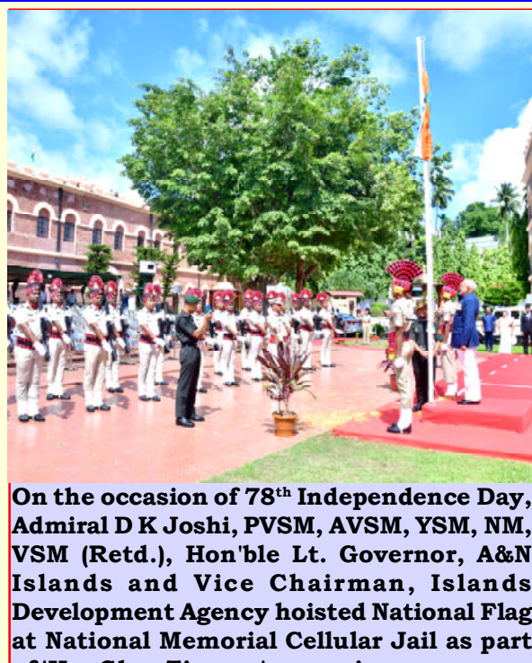
On the occasion of 78 th Independence Day, Admiral D K Joshi, PVSM, AVSM, YSM, NM, VSM (Retd.), Hon'ble Lt. Governor, A&N Islands and Vice Chairman, Islands Development Agency hoisted National Flag at National Memorial Cellular Jail as part of 'Har Ghar Tiranga' campaign.

Apart from this, several thousand crores have been invested by the A&N Administration in different projects like Rutland Water Projects, new airport terminal etc. In recent months, the mainstream media has published the detailed reports about our many Revolutionary Government Projects not only at the National but also at the International level, the Lt. Governor remarked.